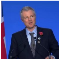
Lord Zac Goldsmith Member of the House of Lords, Former Minister of State for Overseas Territories, Commonwealth, Energy, Climate and Environment

Each edition of the event attracts prestigious speakers from within the industry. Here are some of the world class names who have contributed to previous events: